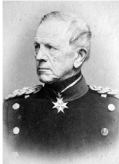
German military strategist Helmuth von Moltke.