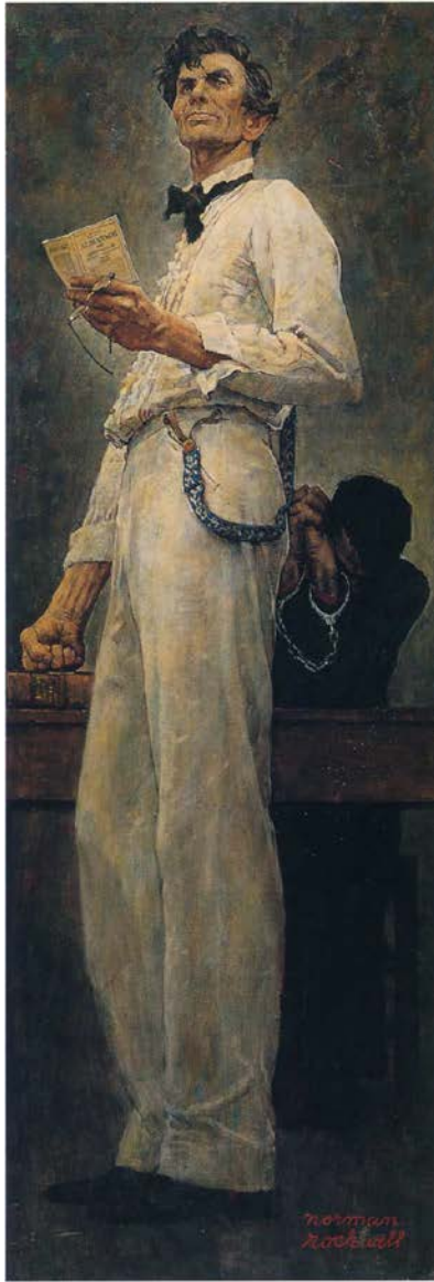
Lincoln for the Defense, 1962