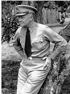
General Dwight D. Eisenhower